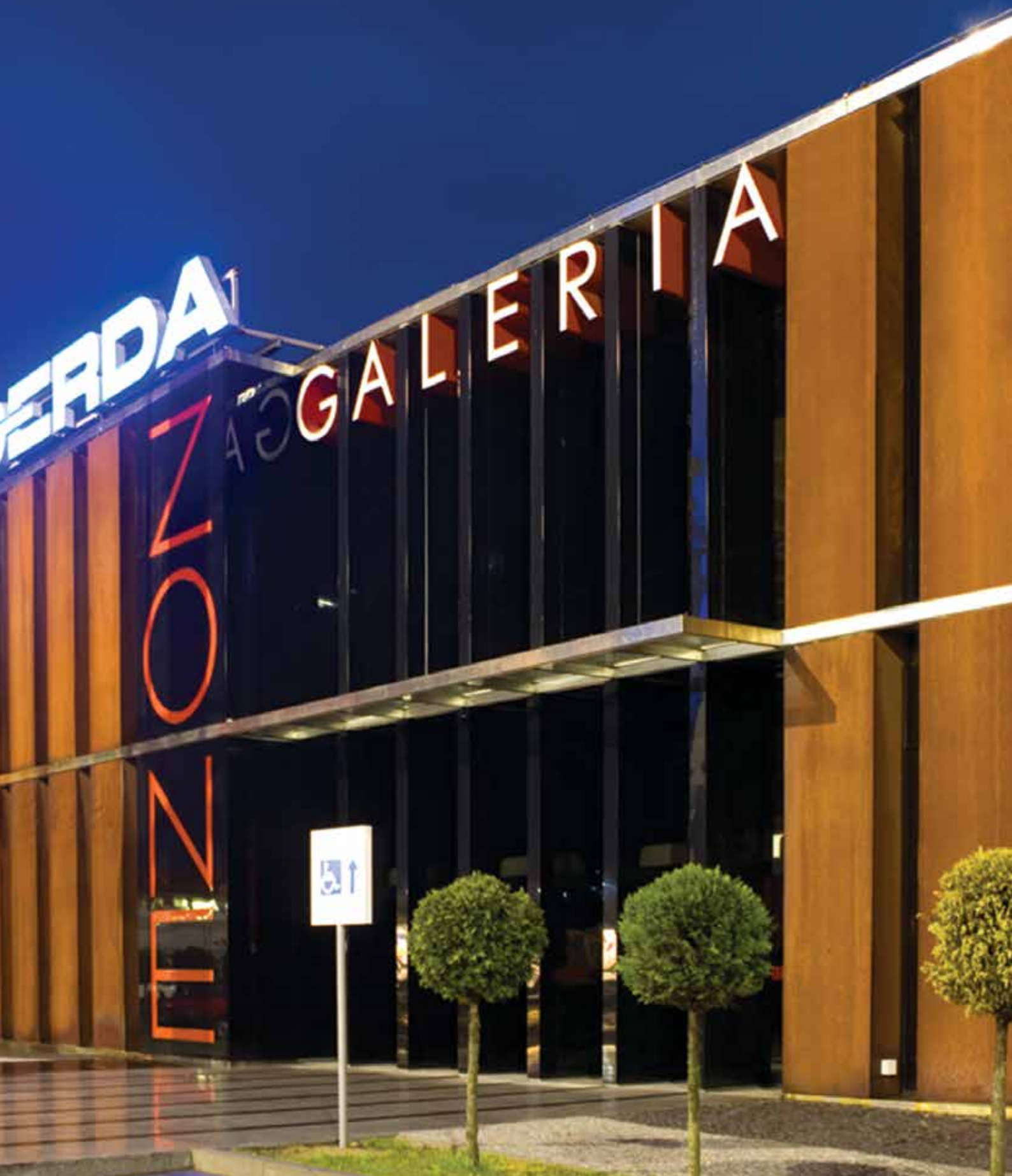
Zone shopping center in Lublin, Poland Designed by: Bieńkowski Lis Mierzwa ARCHITEKCI