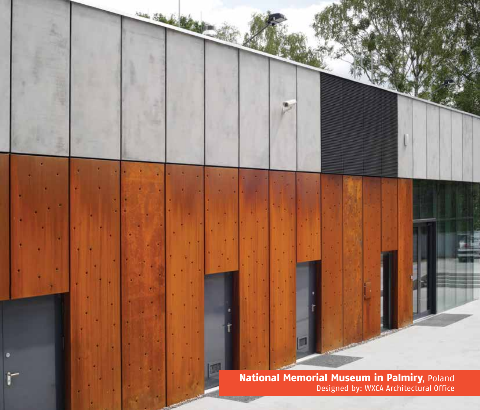
National Memorial Museum in Palmiry, Poland Designed by: WXCA Architectural Office