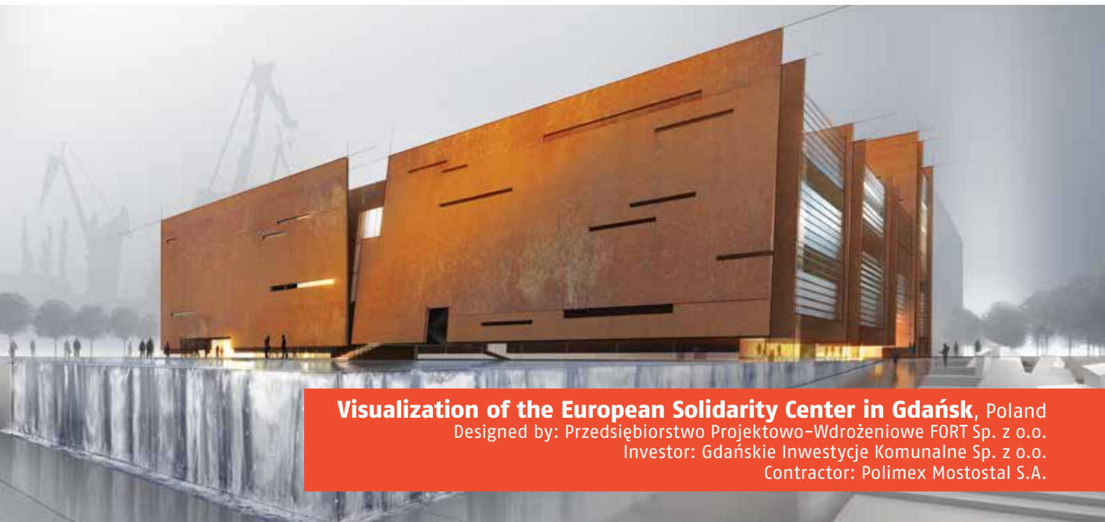
Visualization of the European Solidarity Center in Gdańsk, Poland Designed by: Przedsiębiorstwo Projektowo-Wdrożeniowe FORT Sp. z o.o. Investor: Gdańskie Inwestycje Komunalne Sp. z o.o. Contractor: Polimex Mostostal S.A.

Due to their unique chemical composition, Cor-Ten® flat sheets are significantly more resistant to atmospheric corrosion than similar elements made of standard carbon steel.