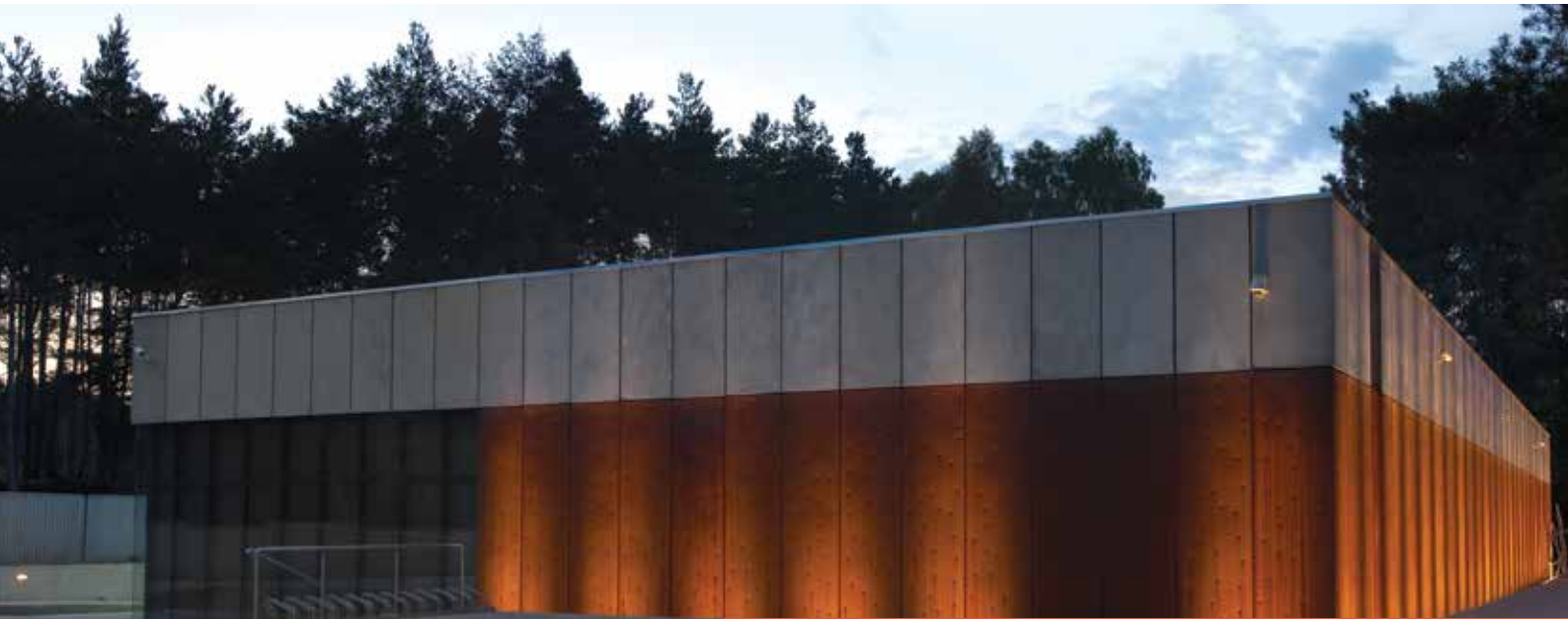
National Memorial Museum in Palmiry, Poland Designed by: WXCA Architectural Office

Cor-Ten® 30 cladding lamellas are a highlighting part of Ruukki Design Palette offering and provide various ways of creating a harmonic and modern image for the façade also with the use of Cor-Ten® steel.