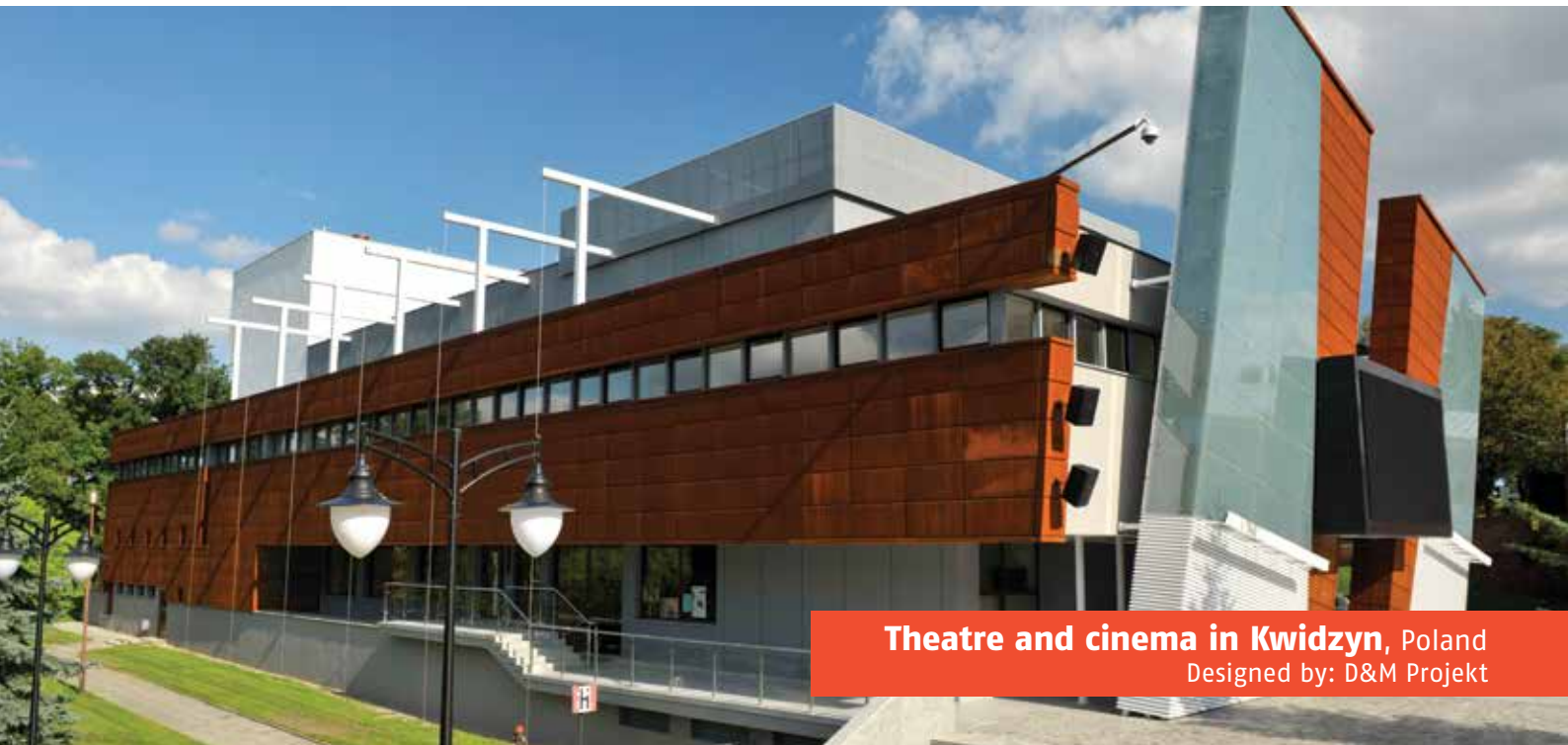
Theatre and cinema in Kwidzyn, Poland Designed by: D&M Projekt

Ruukki Liberta rainscreen panel offering includes panels made of Cor-Ten® steel. Together with accessories they create a complete and accurately dimensioned façade system that thanks to its full patina formation process ensures high quality of façade surface finishing. Liberta Cor-Ten® 600 rainscreen panels are made of steel sheets with specially formed edges. Individual selection of panel sizes provides extensive possibilities for the façade design.