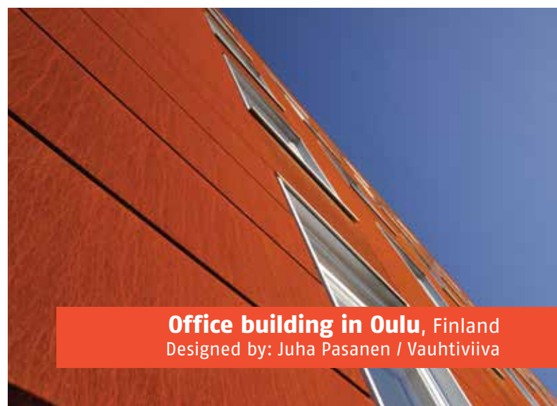
Office building in Oulu, Finland Designed by: Juha Pasanen / Vauhtiviiva

This product range, delivered in form of heavy plates, cut-to-length sheets, strip and coil products, is manufactured based on the US Steel Corporation license and meets the requirements of EN 100255:2004.